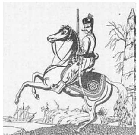
A Zaporozhian Cossack